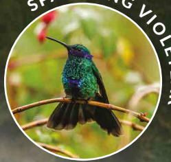
SPARKLING VIOLET EARS

BIG MATCH FUND FORTNIGHT 11-25 OCTOBER 2023